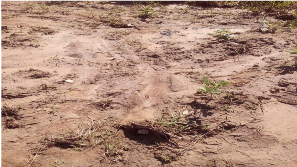
Fig. 2 Rill erosion damaging ridges in cowpea field

The concentration of overland flow, caused by surface irregularities and variations in topography, leads to rills (channels) (Fig. 2). Concentration of runoff in these channels creates an increase in the efficiency and intensity of soil removal. Rill erosion is more dominant on shorter, steeper slopes while interrill erosion is more important on longer, gentler inclines. Rills erode downward until they reach the soil layer of low susceptibility to erosion. After that the rills widen by lateral erosion. If the subsoil is also susceptible to erosion, rills eventually transform into gullies.