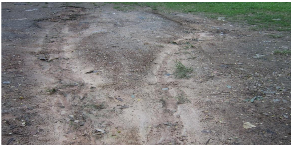
Fig. 3 Early stage of gully erosion

Gullies can develop through multiple mechanisms and are less common than rills, but where locally formed can erode soil at greater rates than rills. Gully dimensions are highly variable, but are typically 0.5–30m deep and again particle size of eroded sediment is non-selective. Soil can also be lost in agro ecosystems through mass movements, in the form of rotational and transitional landslides. Such features are usually localized and tend to be associated with the steepest ground (>20° with relatively little vegetation cover and with significant variations in water table height). Although localized, landslides can result in massive and non-selective soil losses downslope.