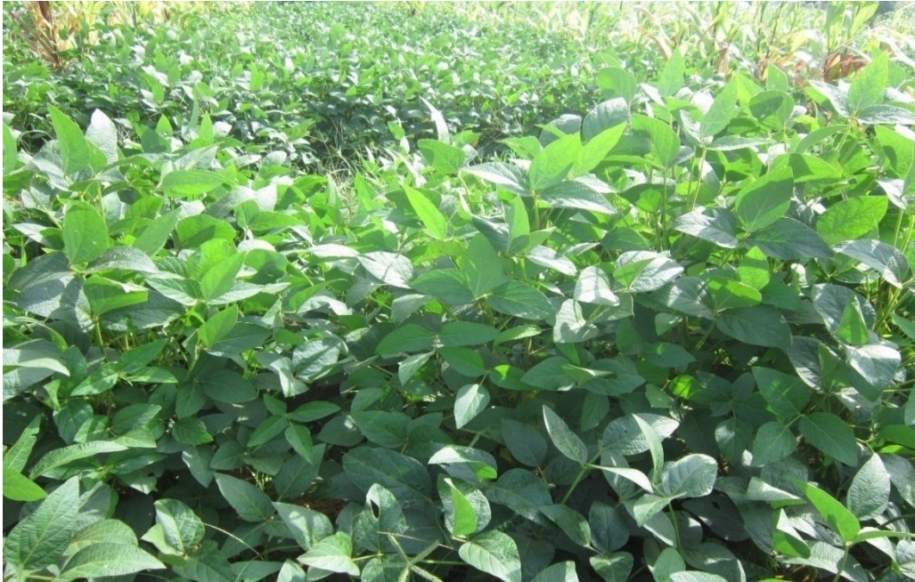
Fig. 4 Soybean field as cover crop

Cover crops also positively influence physical soil properties such as the infiltration rate, moisture content, and bulk density. They increase the organic matter content, nitrogen (N) levels by the use of N_2 -fixing legumes, the cation exchange capacity, and hence crop yields. Another benefit of cover crops is the suppression of weeds, such as speargrass ( Imperata cylindrica ) or witchweed ( Striga hermonthica ) which are common in Nigeria. Farmers benefit from cultivating cover crops as soil loss is reduced and physicochemical soil properties are improved. However, one of the problems of cover crops can be the intensive growth of several cover crop species that might result in competition with food crops for growth factors. This problem can be combated by choosing compatible crops and by controlling the cover crop by timely cutting.