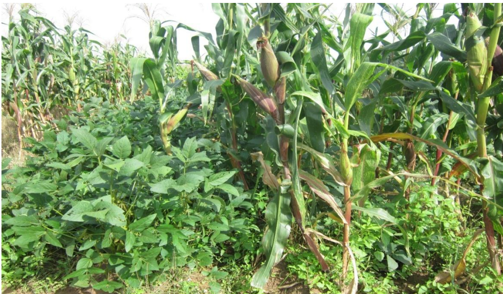
Fig.5 Maize-soybean intercropping system (2 rows maize:2 rows soybean)

intercropping of cereals such as maize ( Zea mays ), sorghum ( Sorghum bicolor ) or millet ( Pennisetum glaucum ) with herbaceous grain legumes or root and tuber crops with other annual crops to improve soil productivity and crop yields. For example it was shown that sole groundnut improved the soils' bulk density at the 0 to 10 cm depth ( 1.26 \text{ g cm}^{-3} ) better than sole maize ( 1.34 \text{ g cm}^{-3} ). The cultivation of legumes also resulted in better stability of soil aggregates in the topsoil, which generally reduces the erodibility of the soil. Incorporation of legume in intercrop results in increase soil nitrogen which increases vegetation growth. The studies on intercropping systems indicate that multiple cropping generally contributes to erosion control. The increased coverage of the soil surface and the enhanced stability of soil aggregate reduce the erosivity of the rain and the erodibility of the soil. As the productivity of soils cultivated with different crop species is also increased, this measure is likely to be adopted as a soil conservation technology in the tropics.