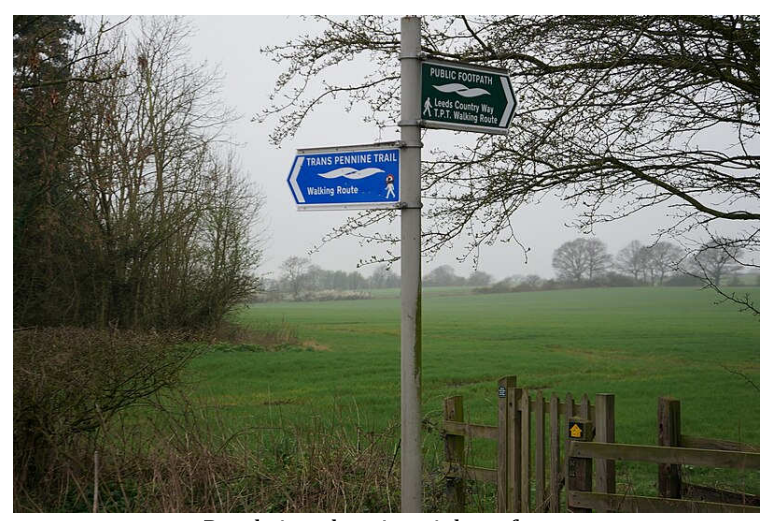
Road sign showing rights of way

"land at any tenure, buildings or parts of buildings (whether the division is horizontal, vertical or made in any other way) and other corporeal hereditaments, also a rent and other incorporeal hereditaments and an easement, right, privilege, or benefit in, over, or derived from land, but not an undivided share in land"