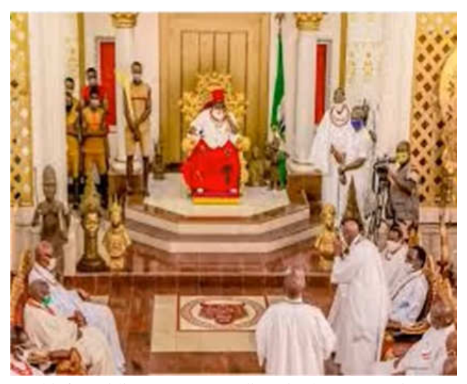
A Chief presiding over proceedings in the community

person in charge and control managing the land on behalf of the entire community with wide powers but accountable to the community. He cannot therefore treat the community land as his own personal property.