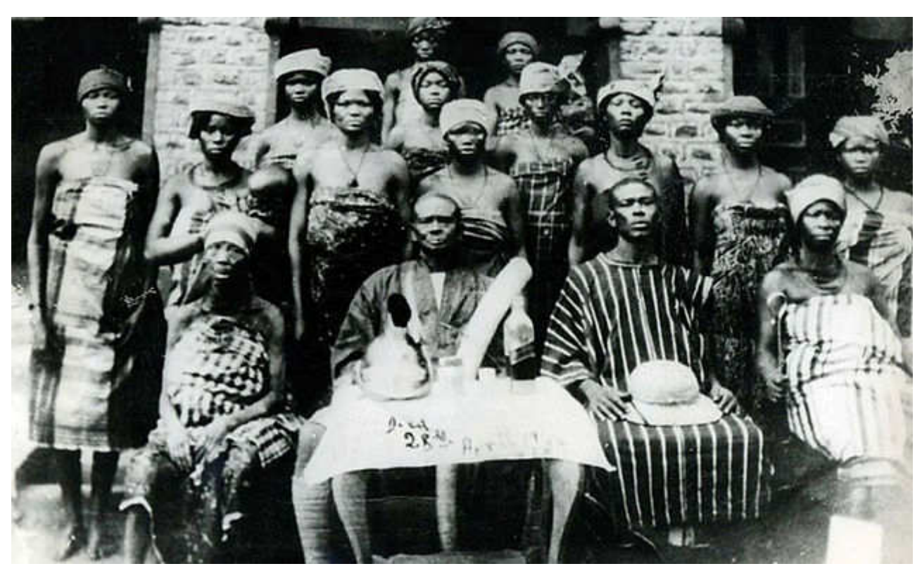
Igbo family picture showing the family head (centre)