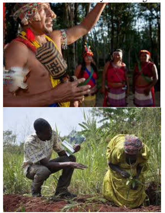
Pictures showing Indigenous Knowledge

Indigenous, traditional or local knowledge has been defined as knowledge that is unique to a given culture or society and communities. It is a local know-how and cultural practices that belong to a community and are transmitted orally between generations.