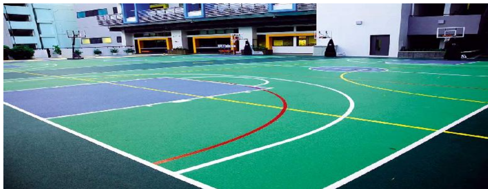
Indoor Multipurpose Hall

Indoor sports halls are commonly useful spaces designed to accommodate a variety of sports. Most of the games played on the court can adequately be accommodated on this single court. An indoor court should have a hard-playing surface.