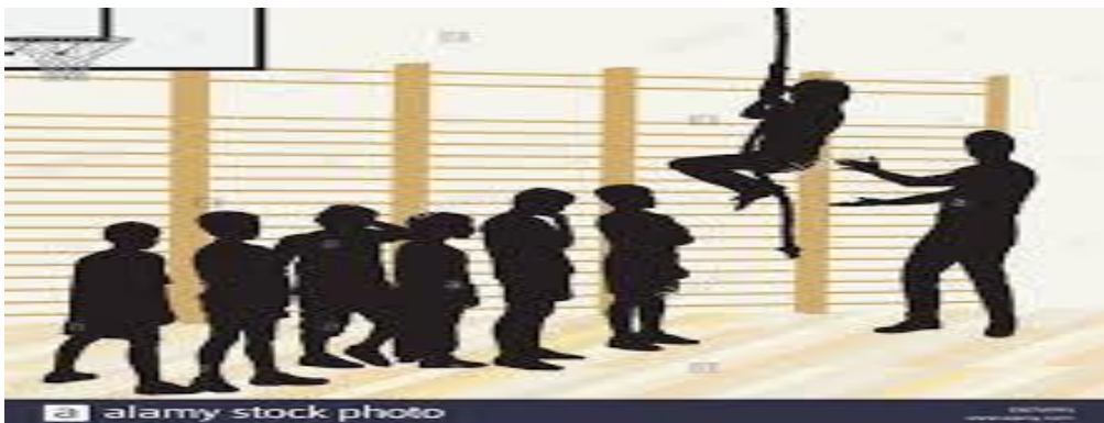
Physical Education Facilities