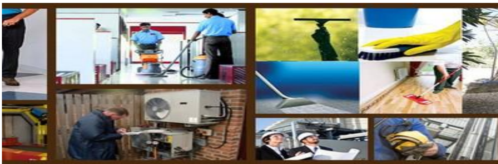
Facility Maintenance Process