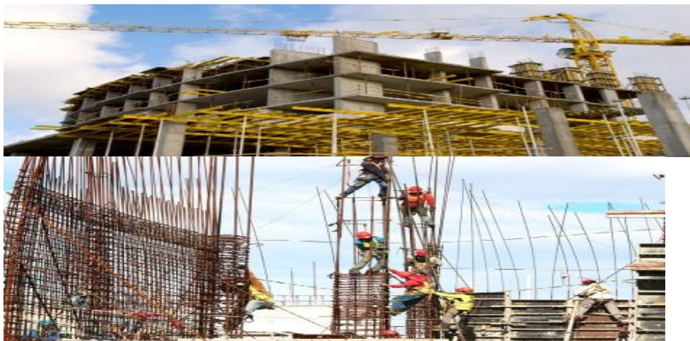
Construction in progress