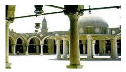
This mosque, built in Cairo by `Amr ibn al-`As, was the first mosque

The main teaching of Al-Muwahhidun was the importance of Tawhid (oneness of Allah) which aimed at bringing the conscience of all Muslims back into the pristine Islam. Having being successful in their teaching, the Al-Muwahhidun were able to make Islam more blossom in North Africa where many great thinkers and scholars such as Ibn Rushd emerged.