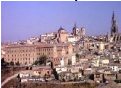
Toledo fell to Christianity in 1085

Aside the internal political wrangling among Muslims, Islamic Empire especially in Spain was greatly threatened by External aggressions from the Christian rulers. By the early eleventh century CE, Islamic empire had been shattered into small weak kingdoms each of them claiming independent authority. Consequently by 1085 CE, Toledo, which was one of the big Islamic centers, fell to Christianity.