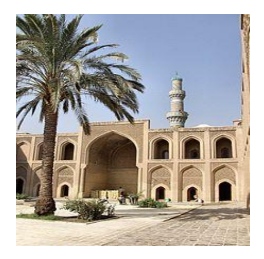
Mustansiriya University in Baghdad showing Islamic architectural

The Umayyad mosque at Damascus and the Dome of the Rock at Jerusalem are two monumental structures depicting the beauty of Islamic architecture dating from the early Umayyad period. Other such edifices include the Khalīfah's palace known as the Golden Gate ( b\bar{a}b al-dhahab), the Green Dome (al-qubbah al-khadra) which was built by the founder of Baghdad and his palace of Eternity (qasr al-khuld). These structures, which are designed with ovoid or elliptical domes, semicircular arches, spiral towers, indented battlements, glazed wall-tiles and metal-covered roofs, are some of the legacies left behind by the early Islamic civilization.