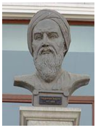
Al-Biruni's bust at an entrance to National

method to mechanics. He was also well known for his ability to combine hydrostatics with dynamics to create what is called hydrodynamics. He also devised his own method of determining the radius of the earth using observation of the height of a mountain.