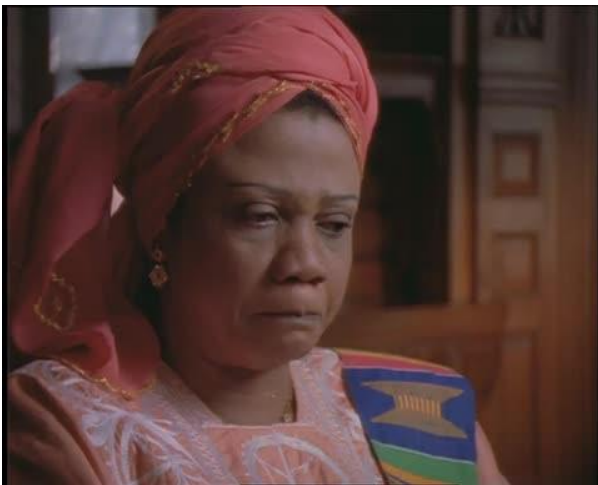
Catherine O. Acholonu, 1951 – 2014.

This African feminism typed was formulated by Catherine Obianuju Acholonu in her book, Motherism – An Afrocentric Alternative to Feminism (1995). In it, she calls for caution in African women’s acceptance of the core tenets of Western feminism, which are mostly contrary to African values. She discusses the importance of motherhood, nurture, respect and care of African women, insisting that these are part of African womanhood which should be considered before going overboard in our dealings with gender relations and with the Western value of individualism. Buchi Emecheta’s The Joys of Motherhood (1979) is contrary to this concept, while Abubakar Gimba’s Sacred Apples (1994) reflects the motherism concept, especially in the dilemma working class mothers face between their family and their careers.