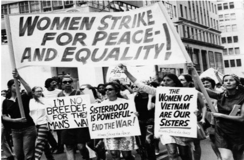
Women's Strike for Peace-And Equality, Women's Strike for Equality, Fifth Avenue, New York, New York, August 26, 1970.