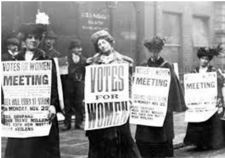
A group of First Wave Feminists in America, carrying placards in support of women and the right to vote.

This period was also rife with the civil rights movements and abolitionist activities. Black women abolitionists joined the feminist struggles to include the rights of black women. Prominent among these black abolitionists were Sojourner Truth (1797 – 1883), Maria Stewart (1803 – 1879), and Frances E. Harper (1825 – 1911).