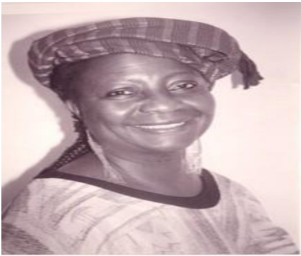
Molaria Ogundipe-Leslie, 1940 – 2019.

feminist discourse exclusion of African women in transforming their men, and developmental issues. She advocates men and women working together as partners, with one sex not claiming to be superior or inferior to the other. Akachi Adimora-Ezeigbo's novels, Children of the Eagle (2002) and House of Symbols (2005) reflect the tenets of Stiwanism.