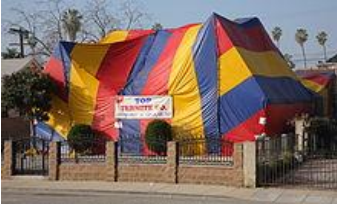
Plate 2: Tent fumigation of a house in America