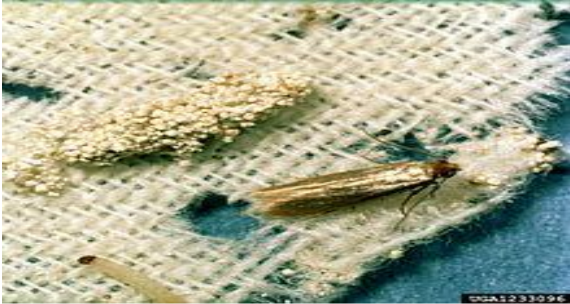
Plate 2: Larva, pupa and adult clothes moth Tineola bisselliella with characteristic damage to fabric