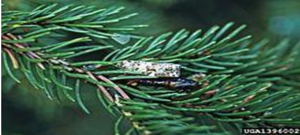
Plate 1: Image of Budworm