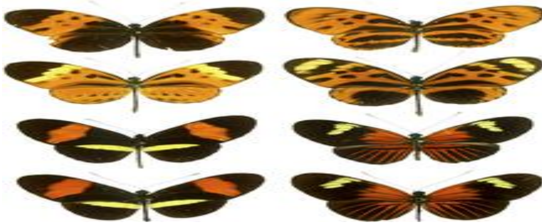
Plate 1: Image of a butterfly

"Physiologic race" redirects here. For the mycology and phytopathology informal classification, see Race (biology) § Physiological race .