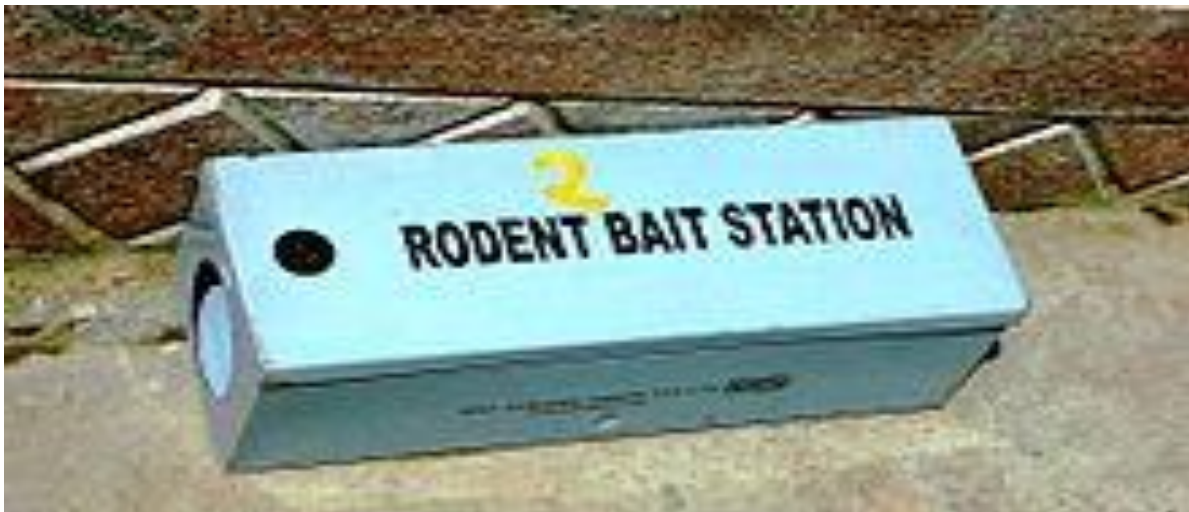
Plate 1: Image of a poisoned bait