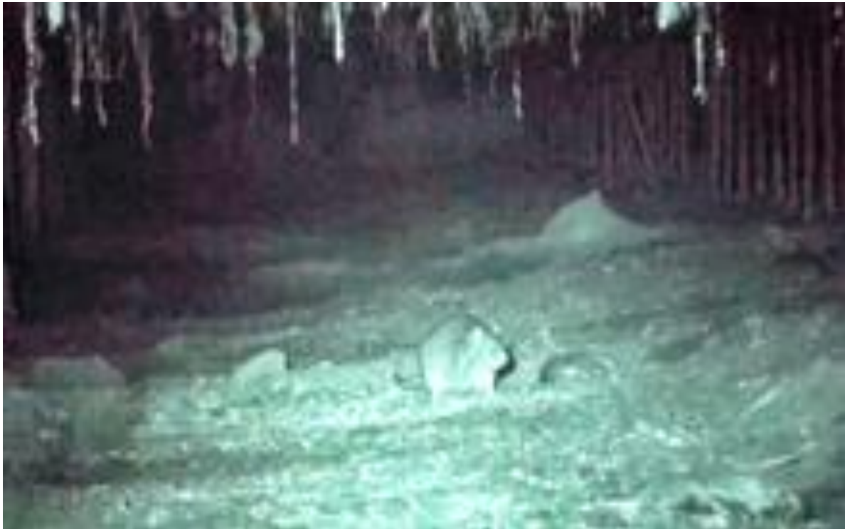
Plate 1: Brown rat infestation