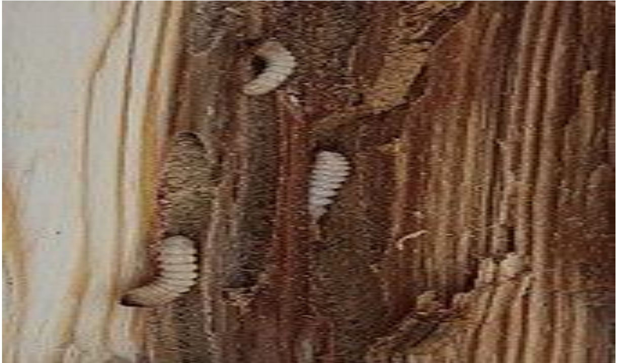
Plate 3: House timber split open to reveal larvae of the house longhorn beetle , Hylotrupes bajulus , in their burrows, which are partially filled with frass .

Source: Organic Materials Review Institute, "The OMRI Product List," http://www.omri.org/OMRI_about_list.html approved product list.