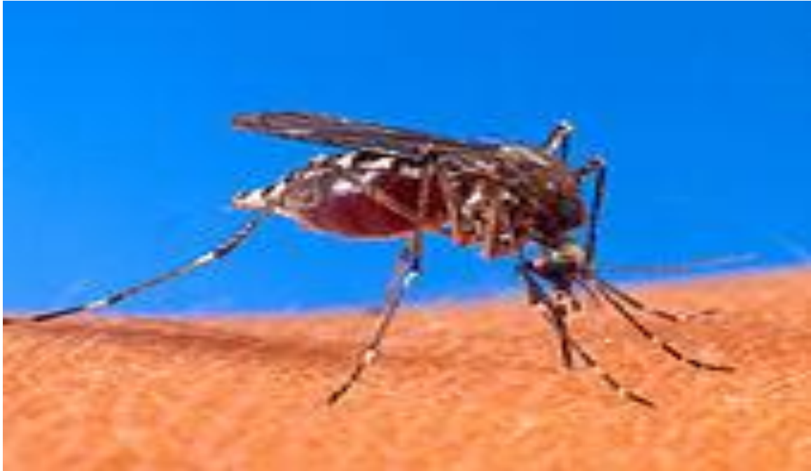
Plate 4: Mosquito ( Aedes aegypti ) biting a human