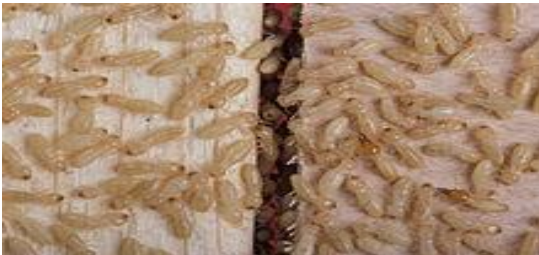
Plate 1: Image of termites

A pest is any living organism, whether animal, plant or fungus, which is invasive or troublesome to plants or animals, human or human concerns, livestock, or human structures. It is a loose concept, as an organism can be a pest in one setting but beneficial, domesticated or acceptable in another.