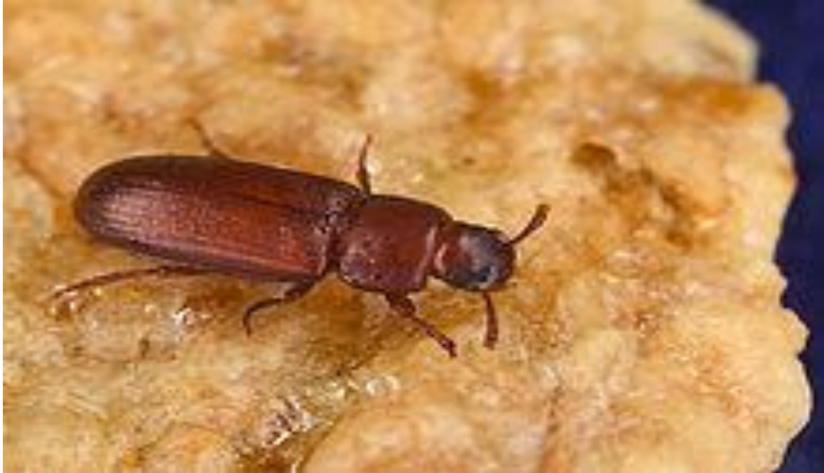
Plate 2: The red flour beetle

The red flour beetle Tribolium castaneum , attacks stored grain products worldwide. Insect pests including the Mediterranean flour moth , the Indian mealmoth , the cigarette beetle , the drugstore beetle , the confused flour beetle , the red flour beetle , the merchant grain beetle , the sawtoothed grain beetle , the wheat weevil , the maize weevil and the rice weevil infest stored dry foods such as flour, cereals and pasta.