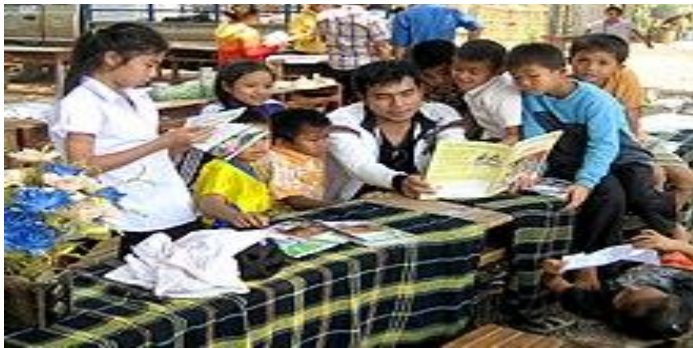
A volunteer reads aloud to children in Laos

Informal learning is one of three forms of learning defined by the Organisation for Economic Co-operation and Development (OECD). Informal learning occurs in a variety of places, such as at home, work, and through daily interactions and shared relationships among members of society. For many learners, this includes language acquisition, cultural norms, and manners.