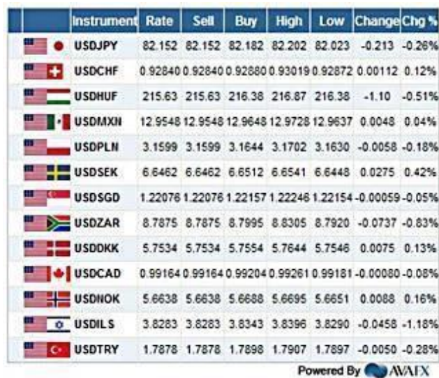
Table 1: US Foreign Exchange Rates