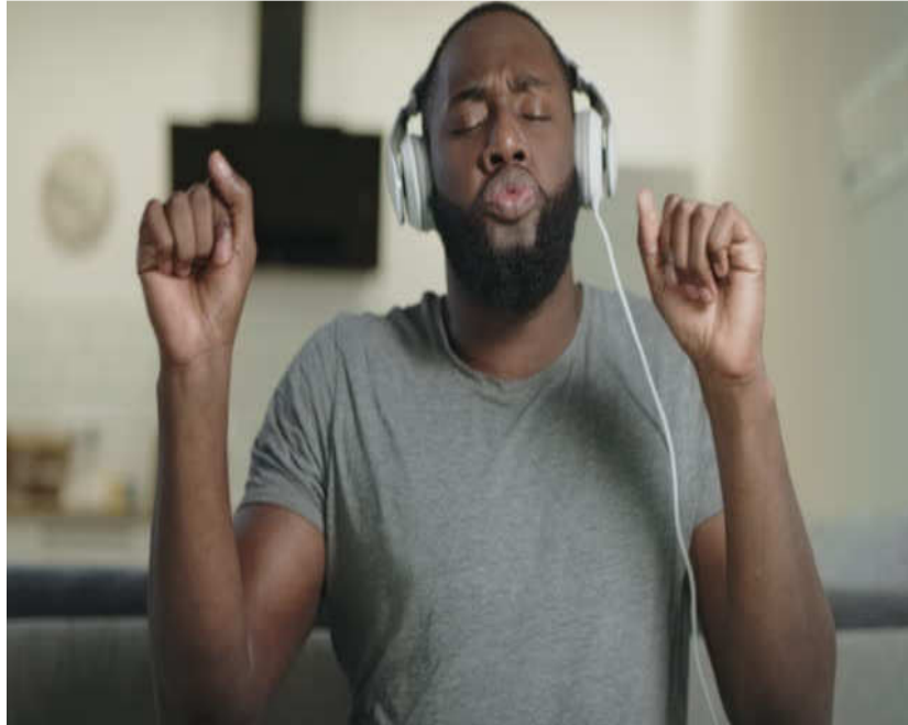
A man being entertained while listening to radio