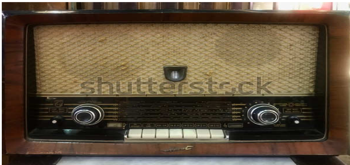
Old Radio Set

To make radio communication possible there must be a sender who encodes sound to radio wave, that is, converts sound into electric signal through the use of a microphone which is further converted to radio wave and is radiated (sent) as frequencies through the use of a transmitter. It is this radio frequency wave that is picked by the radio receiver which converts it to electric signal and in turn is further converted to sound wave through a speaker in a process known as transduction and that is how we get to hear the sound as voices and music. So, there is an encoding and decoding process, that is basically a conversion and reversion process of energy at both ends with a radio transmitter and a radio receiver for radio to work successfully.